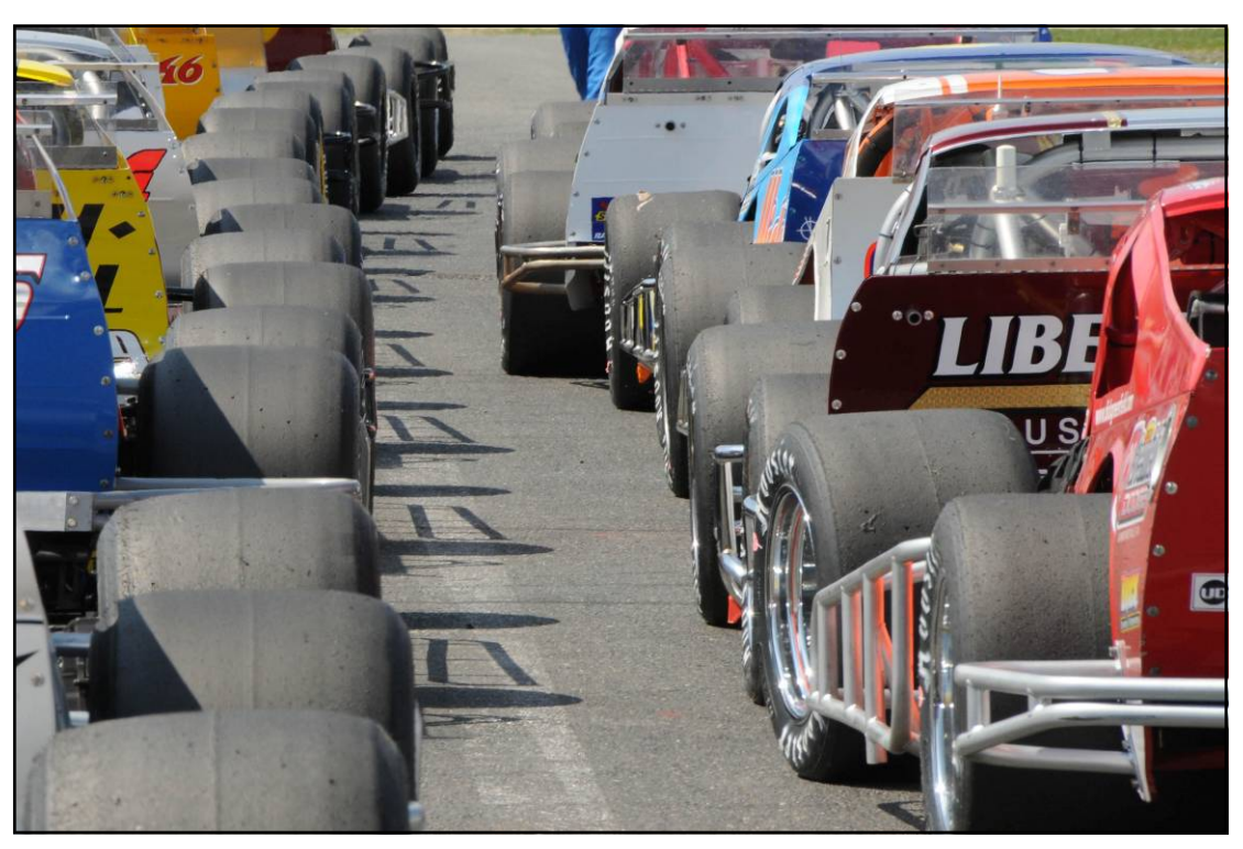
The rescheduled CARQUEST Fall Final will be the last show of the year at Stafford.